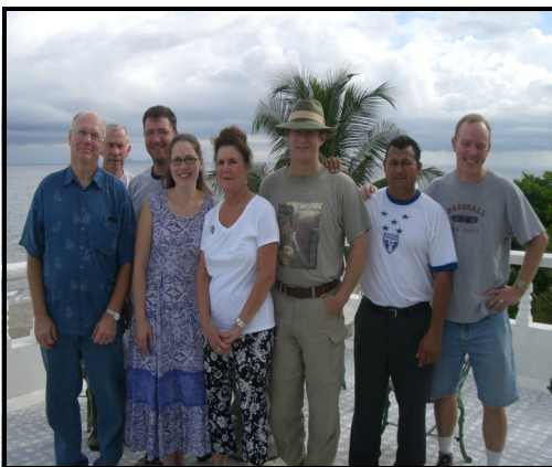
One of the earlier "all star" teams representing four states and five churches

Have you always wanted to go to Honduras but something kept you home? Does your faith enable you to step out of your "comfort zone" to allow God to provide you a life-changing experience? Would you like to gain a worldview by joining a dozen other Christians who desire to live out the second greatest commandment "to love your neighbor as yourself"? Come join the all-star mission team of people from around North America who will go to Trujillo on October 1-13. The 13-day all-inclusive trip cost is $1,200 for airfare, two nights hotel lodging, all meals and lodging in Honduras, transportation, and work project fee.